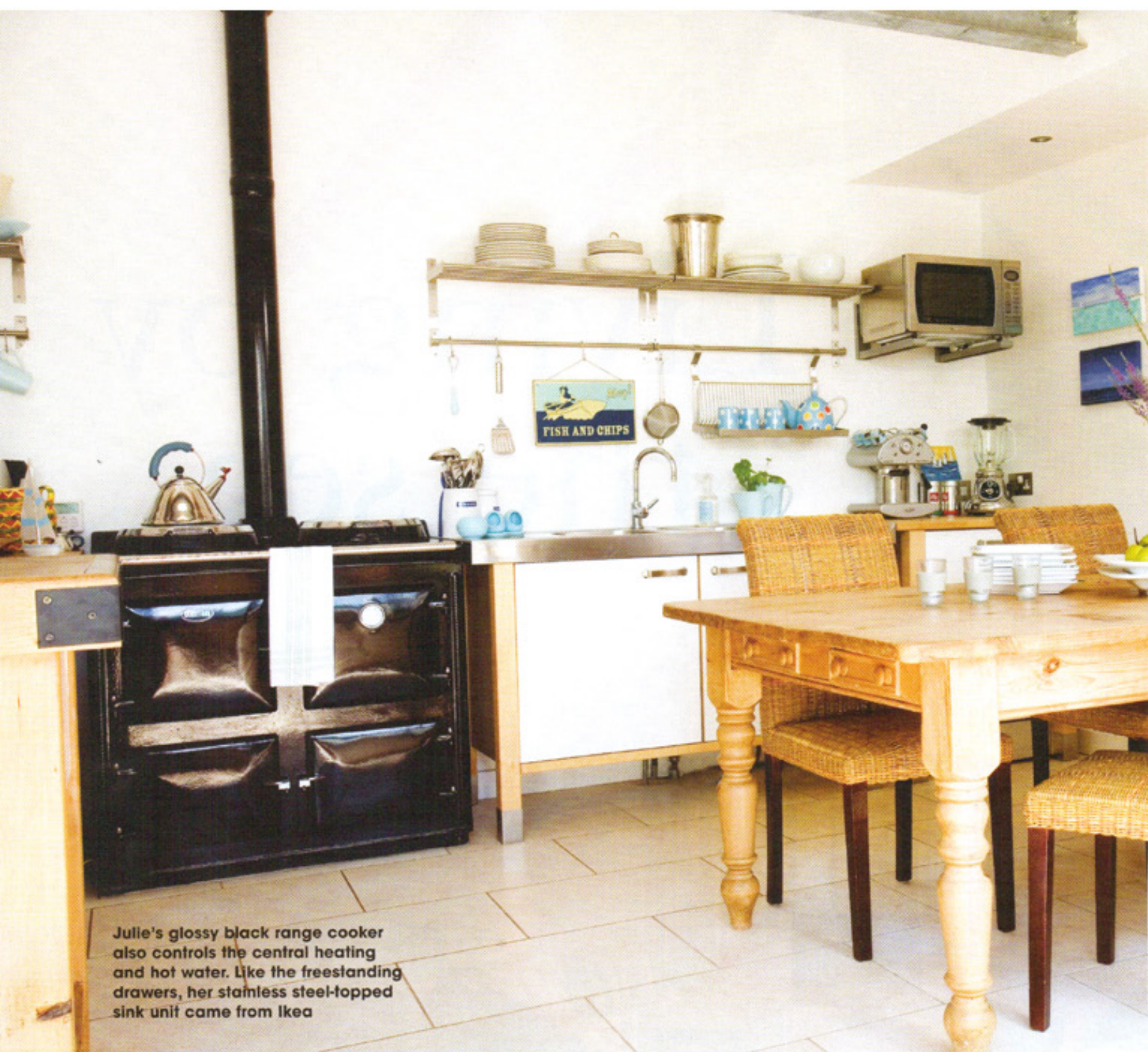
Julie's glossy black range cooker also controls the central heating and hot water. Like the freestanding drawers, her stainless steel-topped sink unit came from Ikea